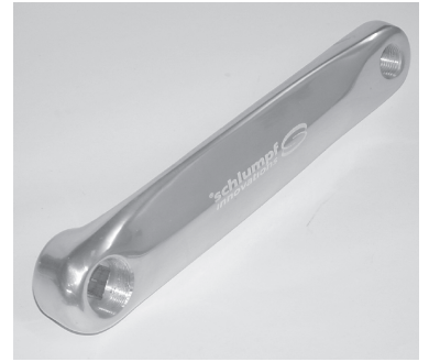
Standard crankarm 170mm, straight shape

The standard crankarm is a cold forged, hand polished high quality crankarm.