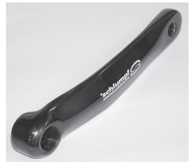
175mm crankarm, offset shape, black anodized