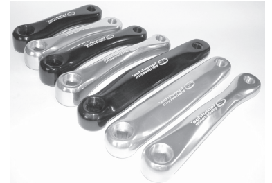
89 - 175mm available

All crankarms are available either with high polished aluminum or black anodized finish.